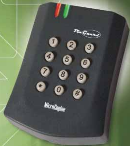
XP-SK32 - Standalone PIN Access System