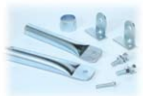
Light Duty Bracket