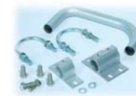
320mm & 490mm Bracket