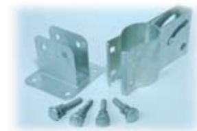
450mm x 600mm 600mm x 800mm 600mm & 800mm Bracket