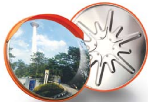
Stainless Steel Mirror 1000mm SUS 430, GI plate