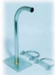
Light Duty Bracket