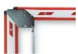
WA14 joint for rods WA1 (from 1850mm to 2400mm)