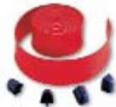
WA6 pack 12m of red, shockproof, rubber strip with caps to close the bars WA21, WA22