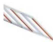
WA13 aluminium rack (2m) for WA1, WA21, WA22 bars