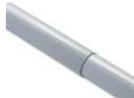
WA24 tubular telescopic bar in white painted aluminium, max. length 8.5m, complete with mobile support WA12, counterweight and connector. 6 meters overall length for transportation. See draft page 61