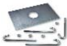
WA16 anchorage base with clamps