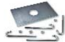
WA15 anchorage base with clamps