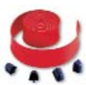
WA2 8m pack of red shockproof rubber strip with caps to close WA1 bar