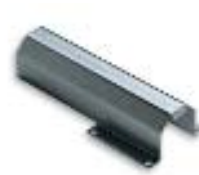
WA4 connection for the WA3 bar