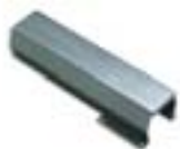
WA8 connection for the WA7 bar