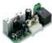
CARICA plug-in card for battery charger for use with A824