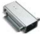
WA25 pivoting connection for rectangular bars up to 4m