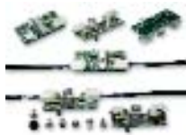
WA9 pack of flashing signals, wired for WA1, WA21, WA22 bars