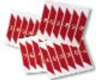
WA10 red adhesive reflector strips