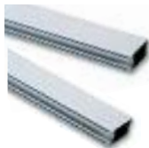
WA22 modular bar, plus joint painted white, 2 sections 36x94x3125mm