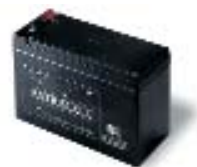
B12-B 12V 6Ah batteries