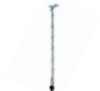
WA12 mobile stand for bars