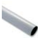
WA3 tubular aluminium bar, painted white Ø70x4250mm, suitable where there are strong winds only with WA11