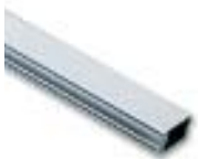
WA21 aluminium bar, painted white 36x94x6250mm