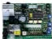
WA20 spare control unit