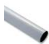
WA7 tubular aluminium bar, painted white Ø90x6250mm suitable where there are strong winds, only with WA11